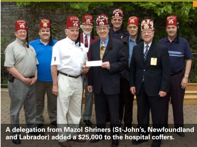
A delegation from Mazol Shriners (St-John's, Newfoundland and Labrador) added a $25,000 to the hospital coffers.